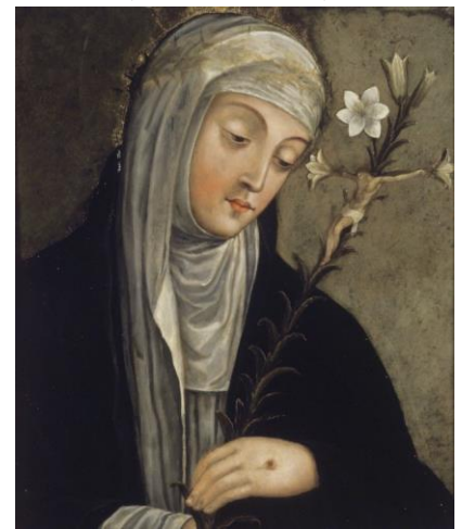
April 29 Patron of Nurses

St. Catherine of Siena Parish (est. 1892)