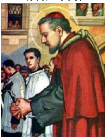
November 4 Patron of Seminarians and Catechists

Oh God, Maintain in your people that spirit with which you inspired your Bishop St. Charles, so that your church may be constantly renewed, conforming itself to Christ and manifesting Christ to the world.